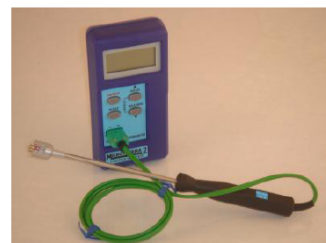
Thermometer and s/s band surface probe to check jaw temperatures.